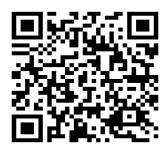
At normal times